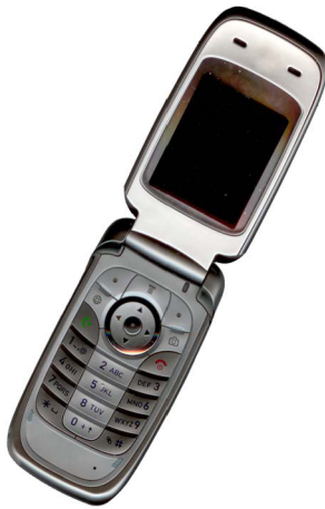
Fig. 3 Example of an image with acceptable resolution