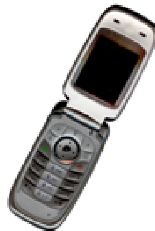
Fig. 2 Example of an unacceptable low-resolution image

Figures must be numbered using Arabic numerals. Figure captions must be in 8 pt Regular font. Captions of a single line (e.g. Fig. 2) must be centered whereas multi-line captions must be justified (e.g. Fig. 1). Captions with figure numbers must be placed after their associated figures, as shown in Fig. 1.